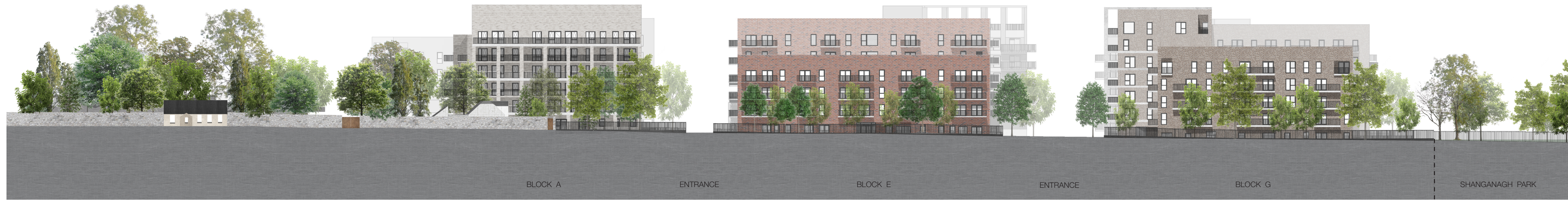
SECTION 01 --- DUBLIN ROAD VIEW